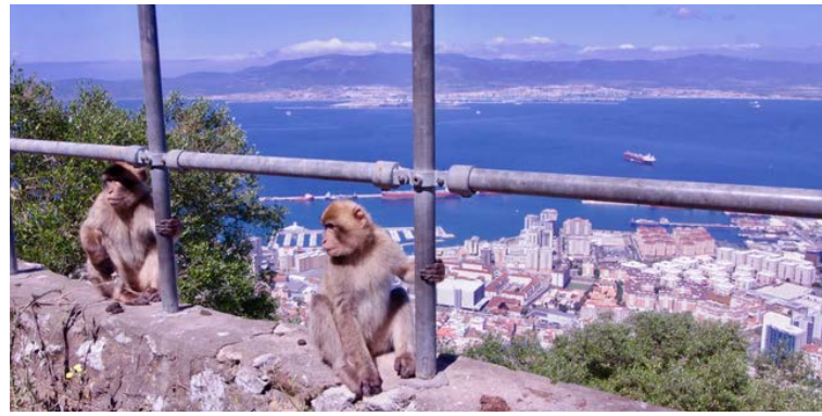
Barbary macaques in Gibraltar.