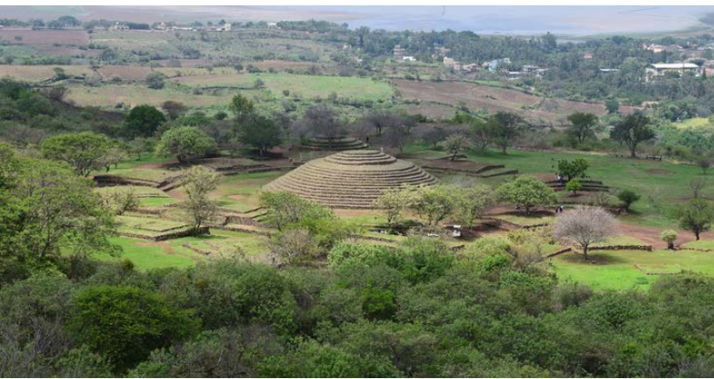
Los Guachimontones, north of Teuchitlan, Jalisco, Mexico.